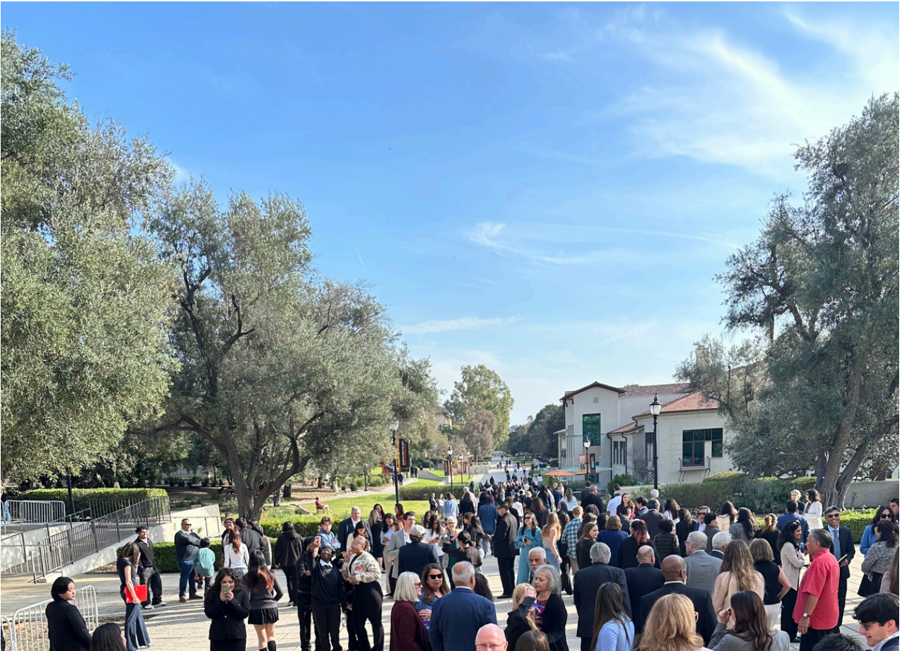
ABOVE: PEOPLE SWARM OUTSIDE THORNE HALL AT OCCIDENTAL COLLEGE