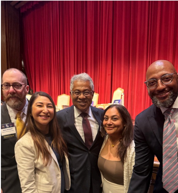
ABOVE: UNITY BAR MEMBERS EXCITEDLY AWAIT JUSTICES TO TAKE THE STAGE